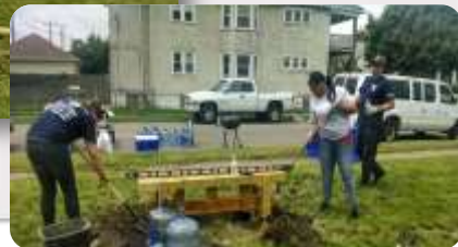
WAYNE COUNTY COMMUNITY DEVELOPMENT, JUNE 2015