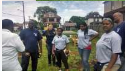
WAYNE COUNTY COMMUNITY DEVELOPMENT, JUNE 2015