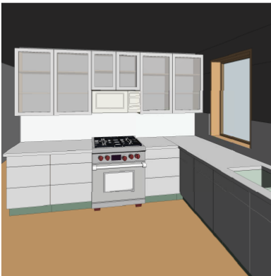
Kitchen (2nd Floor) - East Wall