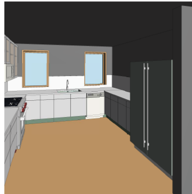
Kitchen (2nd Floor) - South Wall