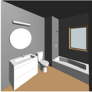
Bathroom (1st Floor) - East/South Wall Perspective