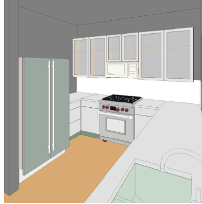
Kitchen (1st Floor) - East Wall