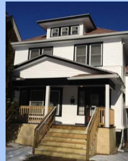
HHD home abated through City of Detroit PDD